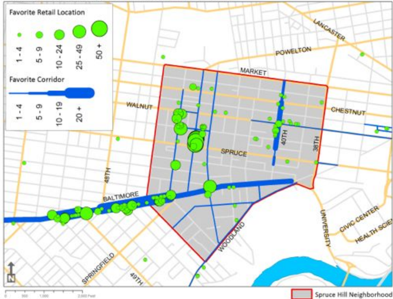
Favorite Retail Locations & Corridors (Number of Votes)