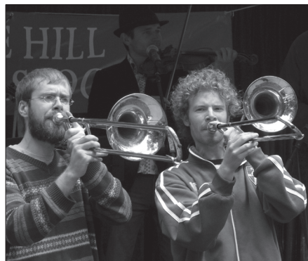
The horns were a bit a last year's May Fair.

and this year SHCA will be on the same page as the University City District and Philadelphia More Beautiful: Put Saturday, June 10, on your calendar for block cleanups. To register your block, send an email to