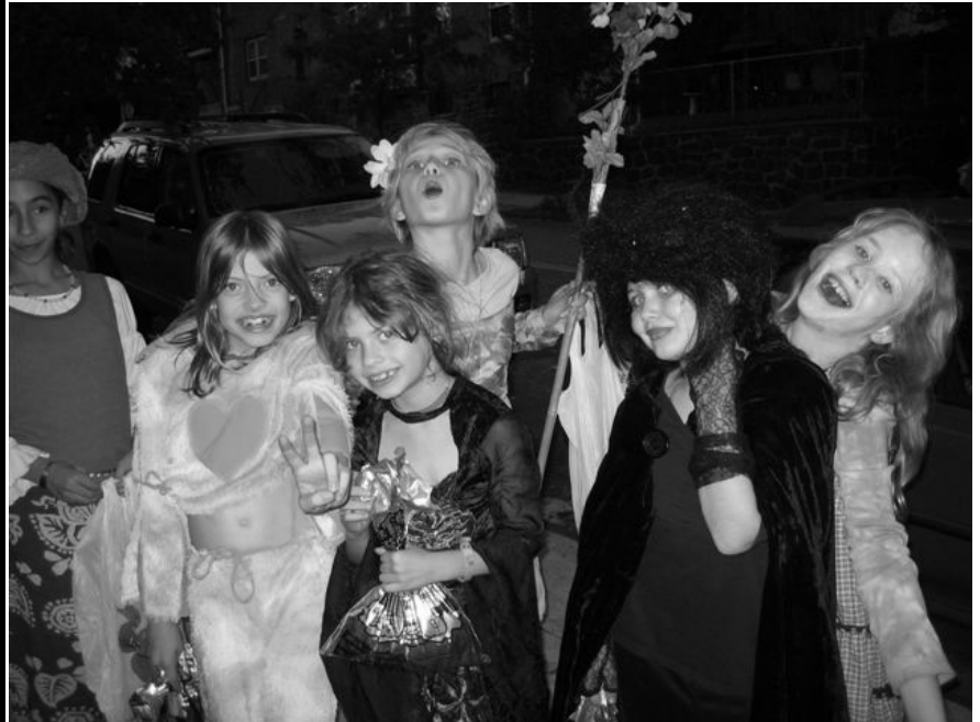
The Spruce Hill Halloween Parade was a smashing success, with more than 250 children strutting their stuff in the neighborhood. More pix, page 3.